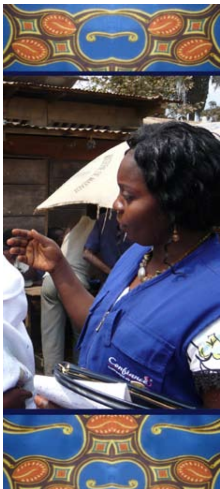
La Ligne Verte number is shared during an IEC session on family planning.

to provide comprehensive training and ongoing support to health care providers and mobile educators to make high-quality information, counseling, and products accessible to low-income individuals in underserved regions of this vast country. The FPP socially markets five contraceptive methods (hormonal and natural, all under the Confiance brand) and, with services and products in place, uses an array of activities—such as la Ligne Verte—to increase knowledge of family planning and respond to interest in and questions about modern contraceptive methods.