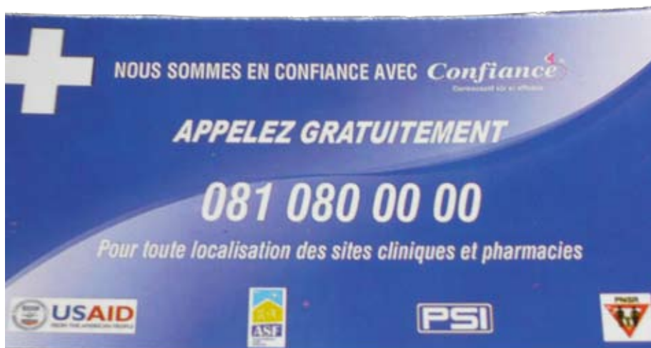
Pocket calendar for "La Ligne Verte"