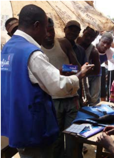
Mobile Educators target men with family planning messages.

PSI and its local affiliate ASF are implementing the FPP (2003 2008) to increase the use of modern contraceptive methods among women of reproductive age and their partners in Kinshasa and in mostly urban areas of Equateur, Bas Congo, Nord Kivu, Sud Kivu, Katanga, Province Orientale, and Kasai Occidental in the DRC.