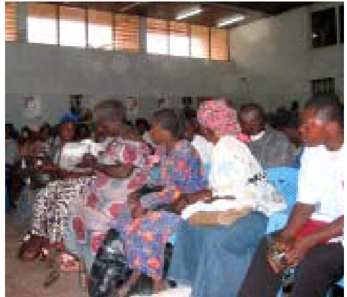
Women writing down the hotline number during a community education session on family planning.

Similarly, close analysis of the locations from which hotline calls are made versus where communication activities are underway will help the FPP better evaluate and compare the results of its local IEC work. For example, an influx of calls from one province following IEC activities may mean that the hotline number is being easily disseminated throughout a community. Alternatively, it may mean that IEC messaging was unclear or confusing. Also, analyzing calls from provinces where the project is not currently active may reveal more about how family planning messages are spreading beyond areas of direct activity.