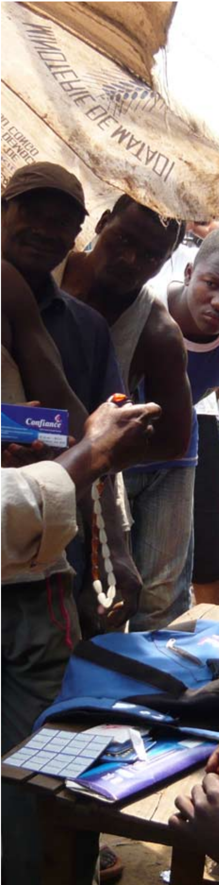
A family planning Mobile Educator shares the hotline number while providing information on family planning.